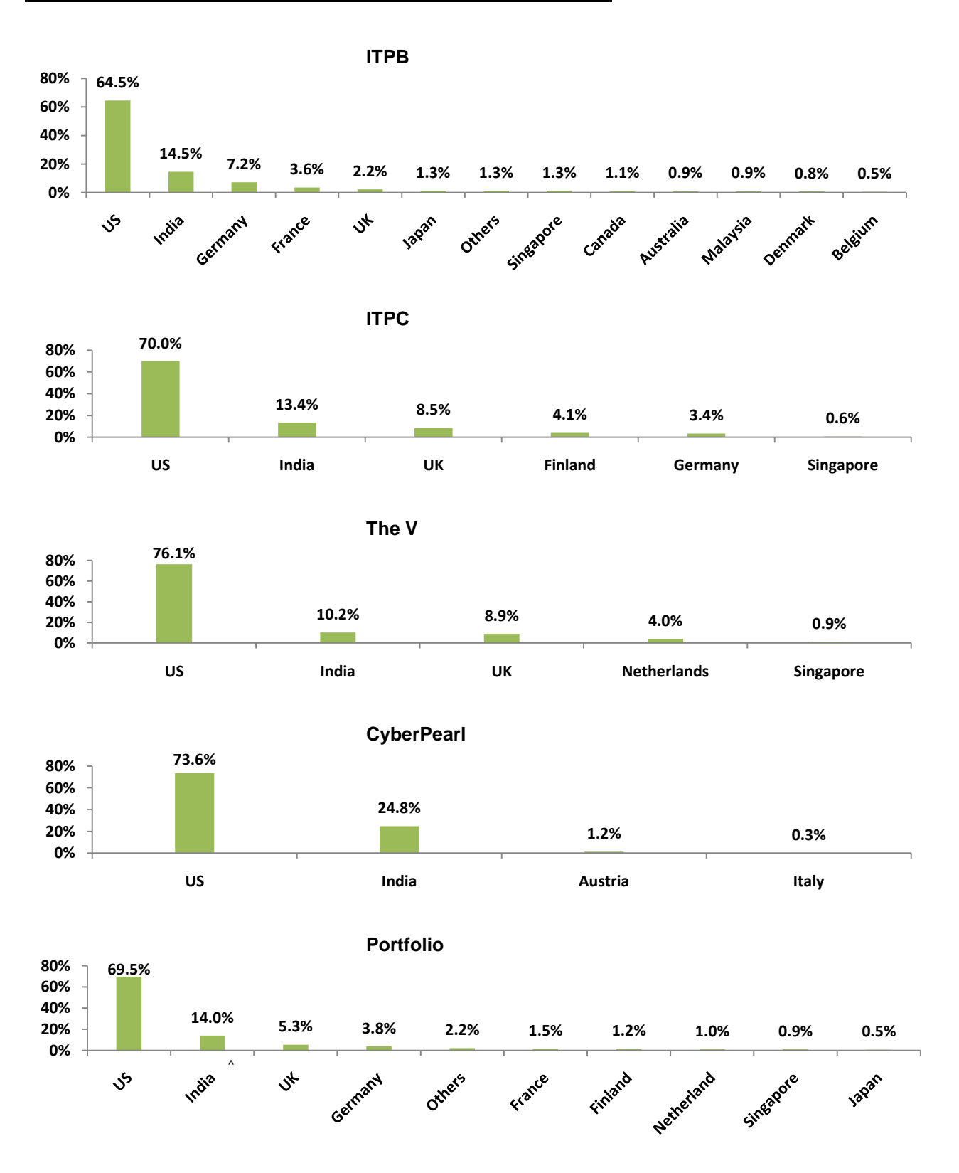
Figure 6: Tenants' Country of Origin by Percentage of Base Rent