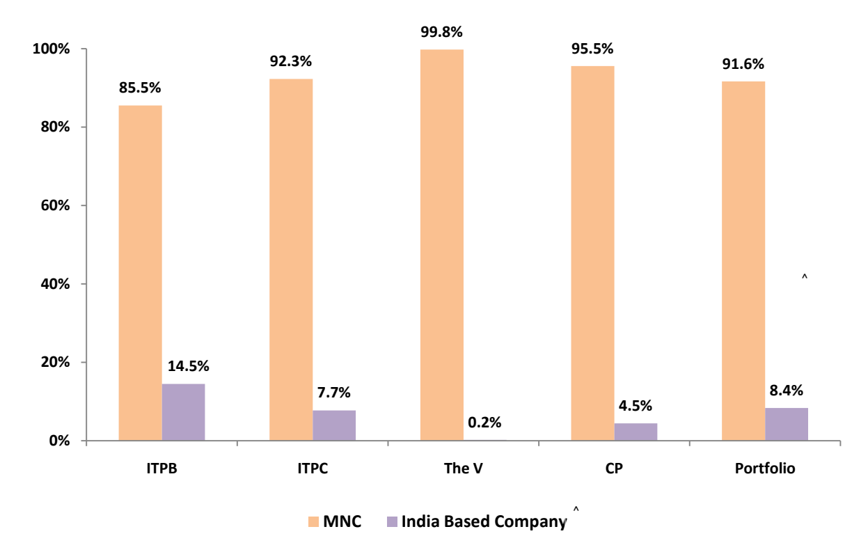
Figure 7 : Tenants' Company Structure by Percentage of Base Rent