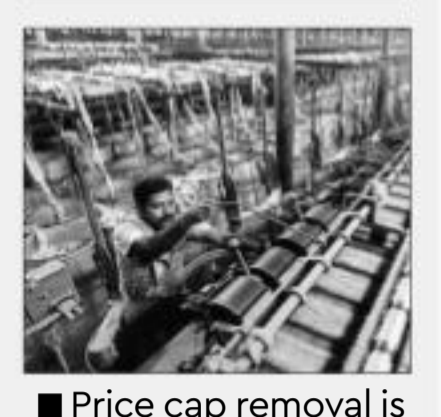
Price cap removal is expected to help farmers, mills and the jute MSME sector There are around 2.5 lakh jute mill workers and 40 lakh jute farmers Capped at ₹6,500 a quintal, the price allegedly led to a crisis in the industry

LPG costlier by ₹3.5, crosses ₹1,000 mark PRESS TRUST OF INDIA New Delhi, May 19 COOKING GAS LPG price was on Thursday hiked by ₹50 per cylinder, the second increase in rate this month following the firming of international energy rates. Non-subsidised LPG now costs ₹1,003 per 14.2-kg cylinder in the national capital, up from ₹999.50 previously, according to a price notification of state-owned fuel retailers. This is the second increase in LPG rate this month and the third in less than two months. The price was hiked by ₹50 per cylinder on March 22 and again by the same quantum on May 7. Since April 2021, prices have risen by ₹193.5 per cylinder. Petrol and diesel prices, however, continue to be on freeze for the 43rd day in a row. The pause followed rates being hiked by a record ₹10 per litre in a matter of 16 days beginning March 22. Non-subsidised cooking gas is the one that consumers buy after exhausting their quota of 12 cylinders at subsidised or below-market rates. However, the government pays no subsidy on LPG in most cities and the price of the refill that consumers, including the poor women who get free connection under the much-talked Ujjwala scheme, is the same as that for non-subsidised or market price LPG.